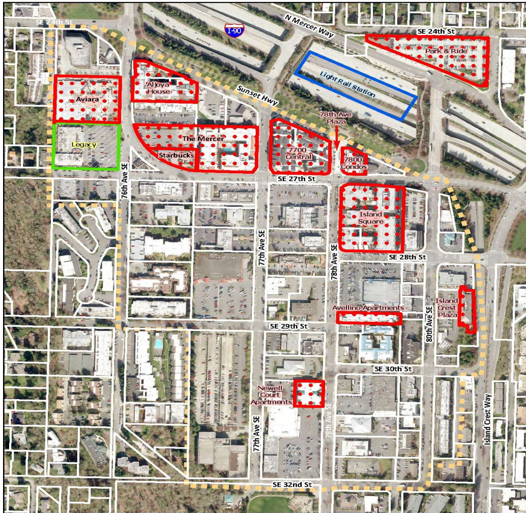
Figure 3: Town Center Development & Business- 2014